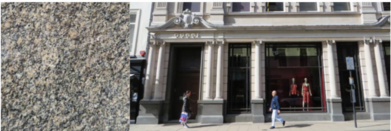
Gucci, 36-8 Old Bond Street. Left detail of the granite used in the foundations, field of view is ~ 8 cm.

The Ionic columns and upper stories are of Portland Whitbed . This stone shows traces of burrows left by marine organisms, 'bioturbation'. This is particularly clear in the columns.