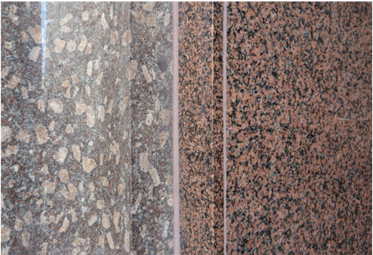
Shap Granite and fine and coarse grained Balmoral Granites at 22, Old Bond Street.

Zanetti & Company Ltd: http://www.zanetticompany.com/default.asp