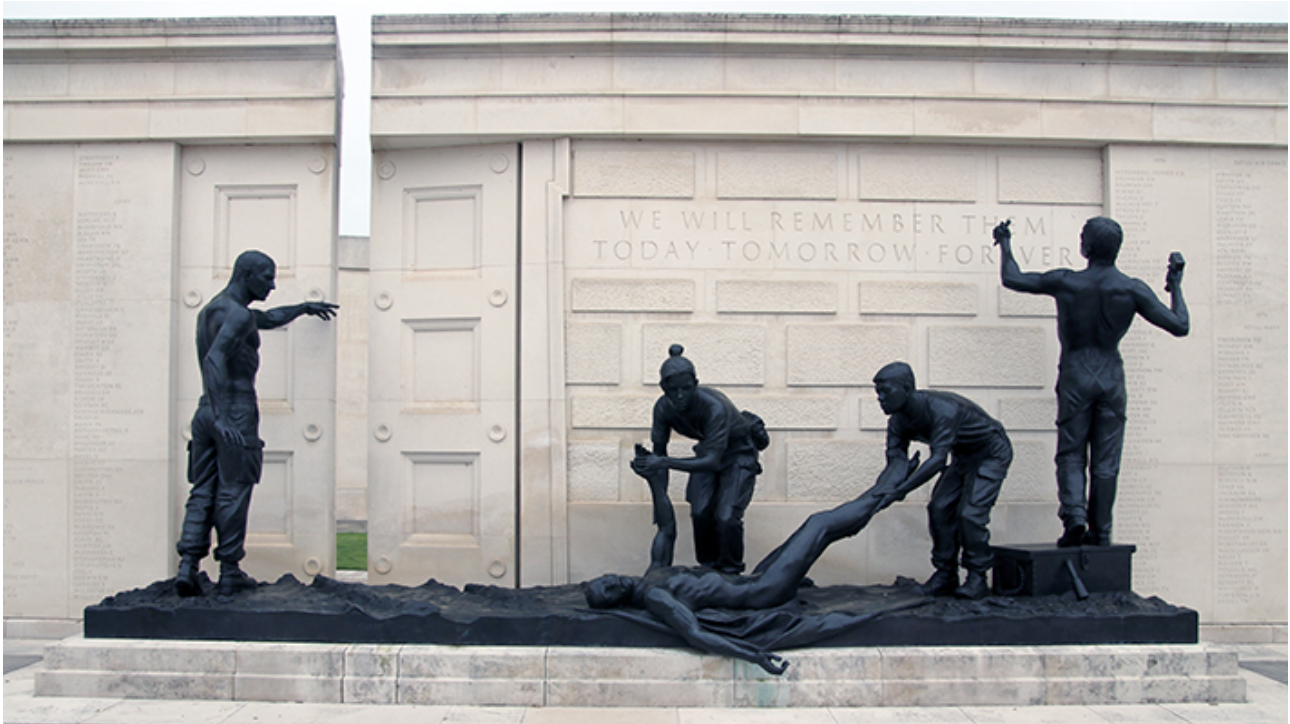
The Armed Forces Memorial; Portland Stone

The National Memorial Arboretum at Alrewas has become established as a garden of National Remembrance, with almost 400 memorials and thousands of commemorative trees (with new ones added every year) which commemorate Her Majesty's Armed Forces who have served in military campaigns since the start of the 20 th Century. Civilian organisations are also represented. These include the Emergency Services and other civilian services, organisations, charities and groups who have served the nation from the UK or the Commonwealth. Other memorials commemorate individuals or groups who have achieved recognition for their service or sacrifice.