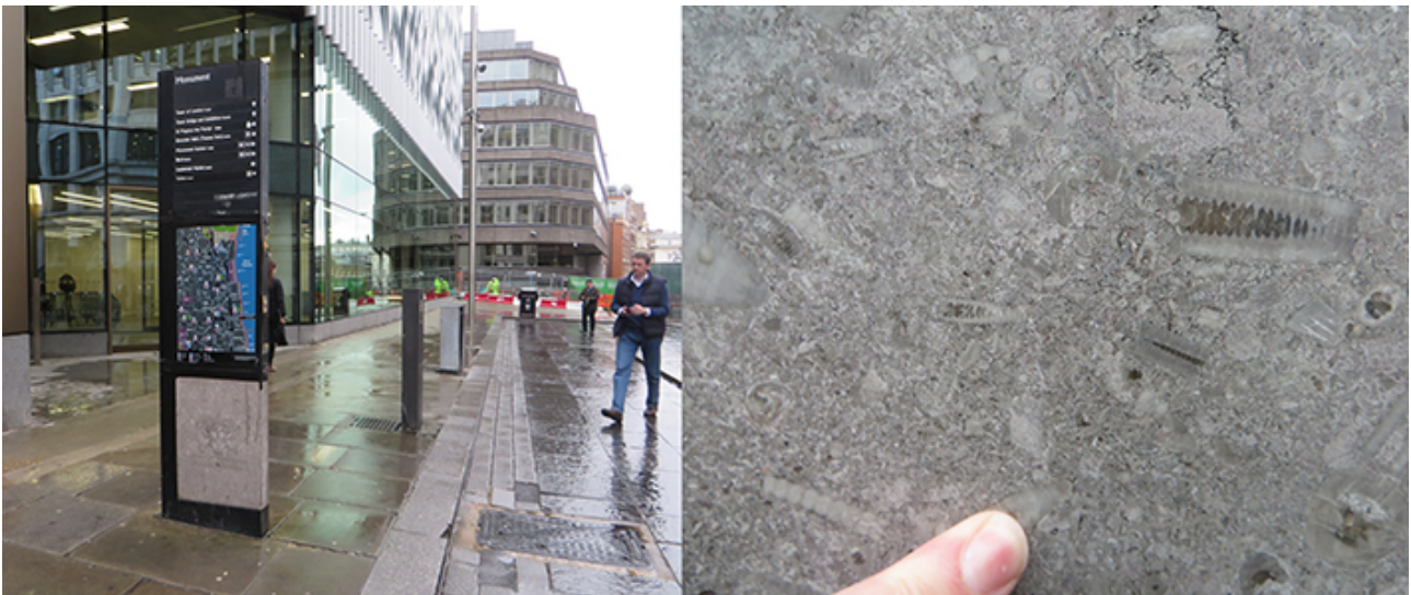
Crinoidal limestone on the City of London sign at The Monument.

These signs have been cropping up across the City of London. Obviously most people look at the map, but the stone plinths on which they stand are made of a beautiful fossiliferous limestone. This is a crinoidal limestone, with enormous fossil crinoids, with stems as big as fingers; some sections through these look like a set of false teeth for a small crocodile. These stone slabs are derived from Derbyshire where they are quarried from beds in a number of quarries. The main workings these days are operated by Mandale Stone Ltd who extract this stone from their 'Once-a-week' Quarry, formerly owned by the Dukes of Devonshire. The stone is known simply as Derbyshire Fossil Marble . It is of Lower Carboniferous age and is extracted from the Eyam and Monsal Dale Limestone Formations.