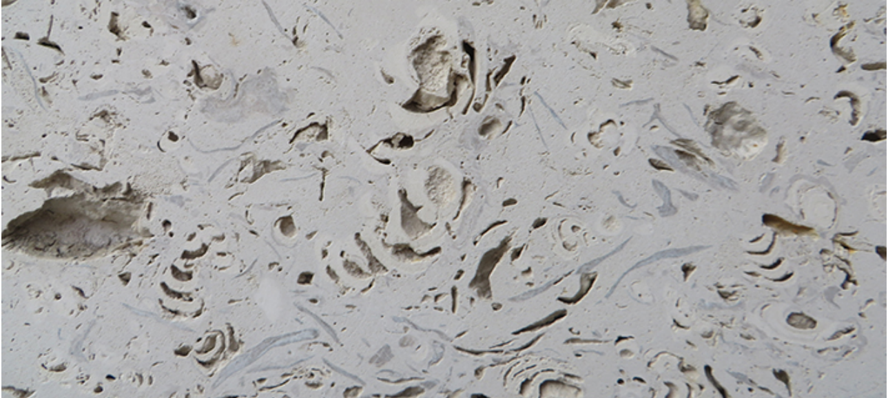
Fancy Beach Whitbed: grey streaks are oysters, cavities where other shells have leached away and white, banded florets are the alga Solenopora.

rich variety of Portland Stone has been used as cladding here. The variety used at Monument Place is called Fancy Beach Whitbed and it is crammed with fossil oyster shells (grey) and the cavities where other shell species have leached out. It also contains abundant fragments of one of the main reef-forming organisms of the Late Jurassic Portland seas, the alga Solenopora portlandia . This limestone, composed of shell debris would have indeed formed in a beach or very shallow marine setting. Imagine a shell beach that has been cemented together, and this is what we have here.