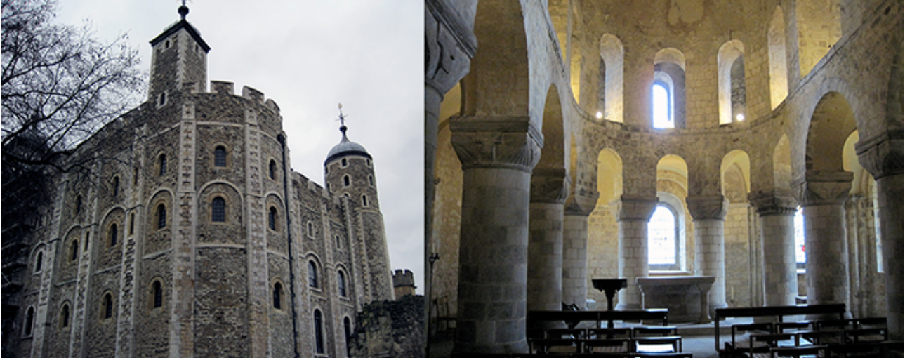
The Tower of London: The White Tower and St John's Chapel.

Portland Stone has been seen (and will be seen) at several locations on this walk and is described therein. It should come as no surprise that 17 th Century and later masons used Portland Stone for running repairs at the Tower.