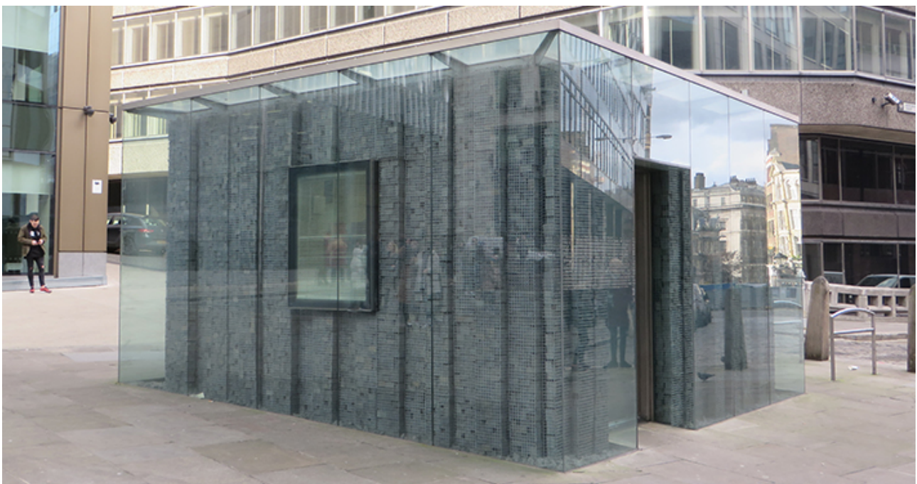
The Monument Pavilion constructed with metal cages – ‘gabions’ – filled with Caithness Stone.

Caithness Stone is used for both paving the square surrounding the monument and also for the stone cobbles used in the gabions which have been used to build the 'Monument Pavilion' a toilet block designed and built in 2006 by Bere Architects. This stone is quarried from the northernmost tip of the Scottish mainland at Spittal. The Caithness Flagstone Group is part of the Devonian Old Red Sandstone, but here the environment of deposition was a muddy lake, nevertheless full of fish, which can be well preserved as fossils in the stone. I have scoured the paving here and sadly have not spotted any fish, however they can show up in paving stones and there are several good examples of fossil fish in the Caithness paving on the streets of Edinburgh (see McGowan & Challands, 2013).