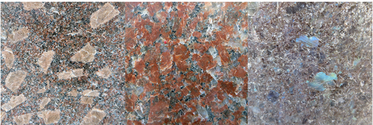
The beautiful igneous plutonic rocks at 24 Great Tower Street: left, Dark Shap Granite, field of view 12 cm; centre, Bon Accord Red FoV 12 cm; right, Labrador Antique, FoV 8cm.

The plinths on which these columns stand are of Dark Shap Granite and the rest of the building is clad with Bon Accord Red . These two stones are much more typical of 19 th or early 20 th Century architecture. Shap Granite, with its distinctive, brick-shaped, pink, K-feldspar phenocrysts is from Shap Fell in Cumbria and is just under 400 million years old. The groundmass is made up of orange K-feldspar, grey quartz, plagioclase and biotite. The coarse-grained red granite cladding is a variety called Bon Accord Red quarried near Uthamar on the Kalmar Coast of Sweden. It is composed of large crystals of brick-red K-feldspar with grey quartz and black biotite. This is a variety of rapakivi granite, intruded during the same magmatic phase as the Baltic Brown Wiborgite seen at our first location. This red granite lacks the ovoids and is the variety of rapakivi granite called pyterlite (named after the type location of Pyterlahti in Finland). It was intruded as part of a suite of granitoids in the Baltic region, known generically as the 'Coastal Reds' by stone workers. This variety comes from the Fieholm Granite, intruded at ~ 1.4 Ga. The name 'Bon Accord' is an allusion to the fact that these granites were shipped direct from the quarry to Aberdeen where they were cut, shaped and polished. 'Bon Accord' is Aberdeen's motto.