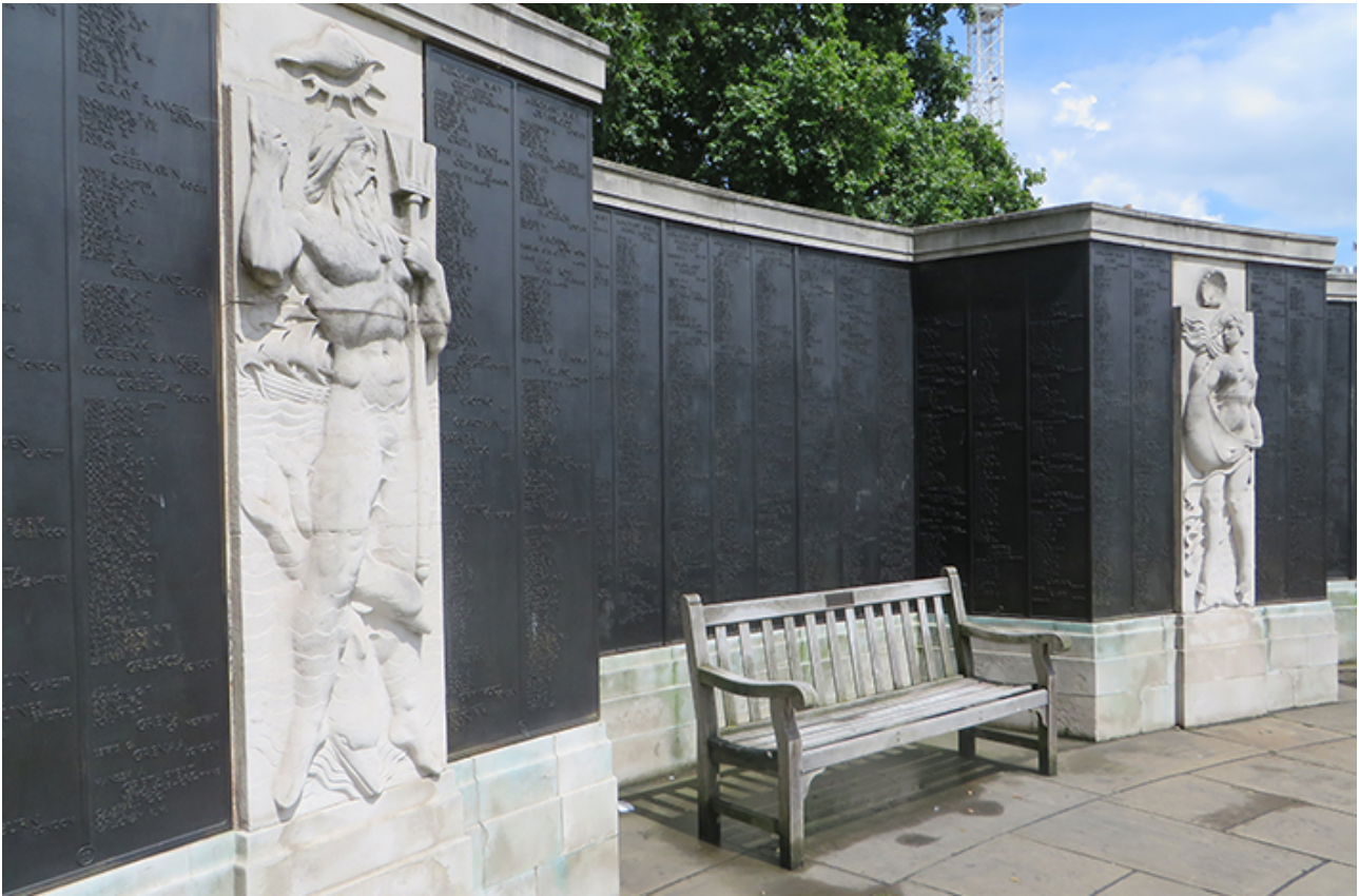
The Merchant Navy Memorial

This memorial marks the end of the walk. The nearest tube station is just across the park at Tower Hill.