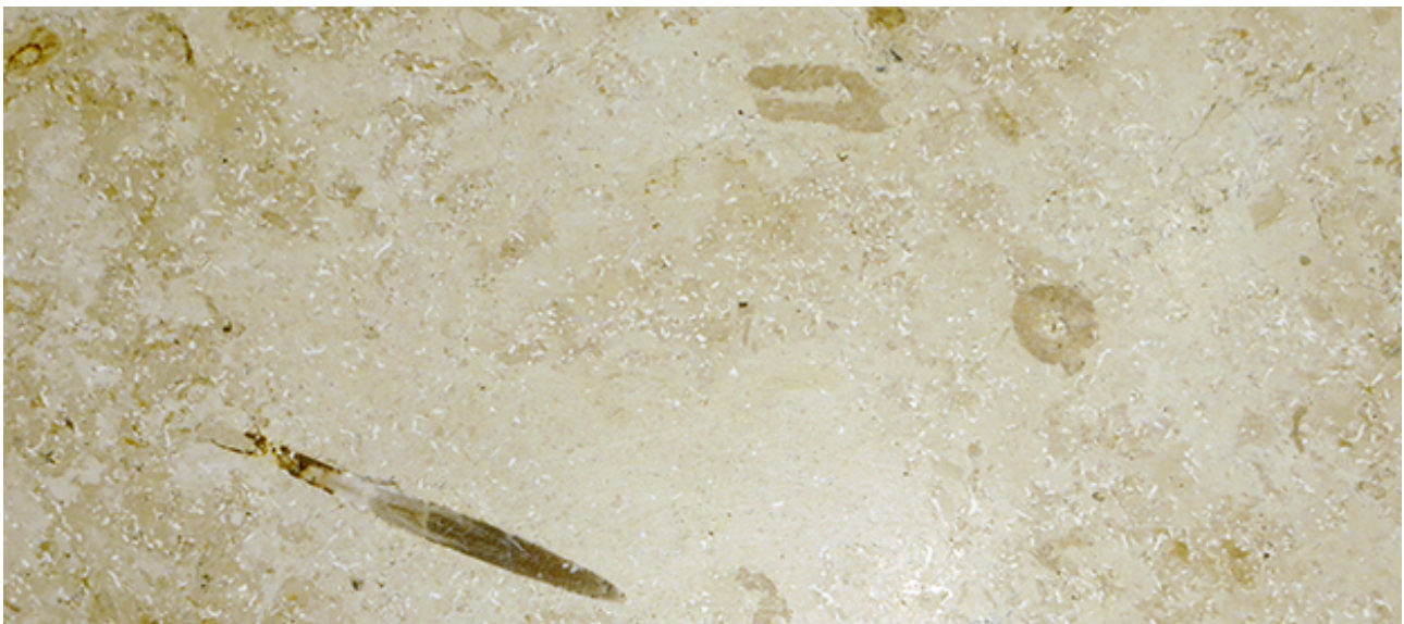
Jura Marble. A belemnite and sponge fossils, surrounded by tubiphyte worm casts.

Two contrasting stones are used, Jura Marble and Nero Marquina. Jura Marble is not a true marble in the geological sense, but the term 'marble' has long been used in the building industry to describe any carbonate rocks which take a good polish, regardless of whether or not they have been metamorphosed. This stone is a nice example of a polished limestone. It is a readily available and relatively cheap stone, and is currently very popular, it can be seen in many shopping malls worldwide. It is derived from German Jura in Central Bavaria, in the Altmühltal National Park. It belongs to the Late Jurassic Treuchtlingen Formation and has many well preserved fossils; ammonoids and belemnites are very common, the belemnites are particularly well-preserved and dark brown in colour. The Treuchtlingen seas were dominated by sponge biostromes and fossils of these are very abundant in the rock, as mottled, brown, sometimes ring-shaped structures. These were colonized by millions of calcite-encrusted tubiphyte worms and these can be seen as millimeter-size white flecks throughout the rock.