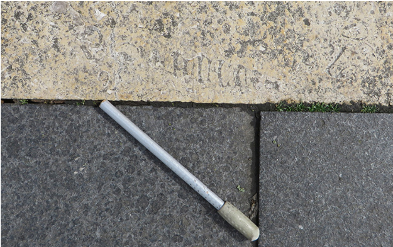
Hauteville Limestone and Black Pearl Basalt paving, St Martin's Square.

Slabs of Hauteville Limestone are used as paving in front of the church porch. This has a distinctive yellow to pink colour variation, enhanced by abundant bioturbation. Hauteville is a Lower Cretaceous limestone quarried from the eponymous French village. As the name suggests, the quarries are located high in the French Jura and it is quarried seasonally; the quarries are buried in snow in the winter months. Hauteville Stone is variably fossiliferous, and a few examples are seen here. The surfaces of these slabs are rather battered, but look for the large (10 cm) long section through a helically coiled ammonoid, Turrillites costatus , right on the very edge of a slab, up against the paving stones of St Martin's Square. The black stone immediately adjacent to the Hauteville is the pyroxene-phyric, Cretaceous basalt from China, marketed as Black Pearl (below).