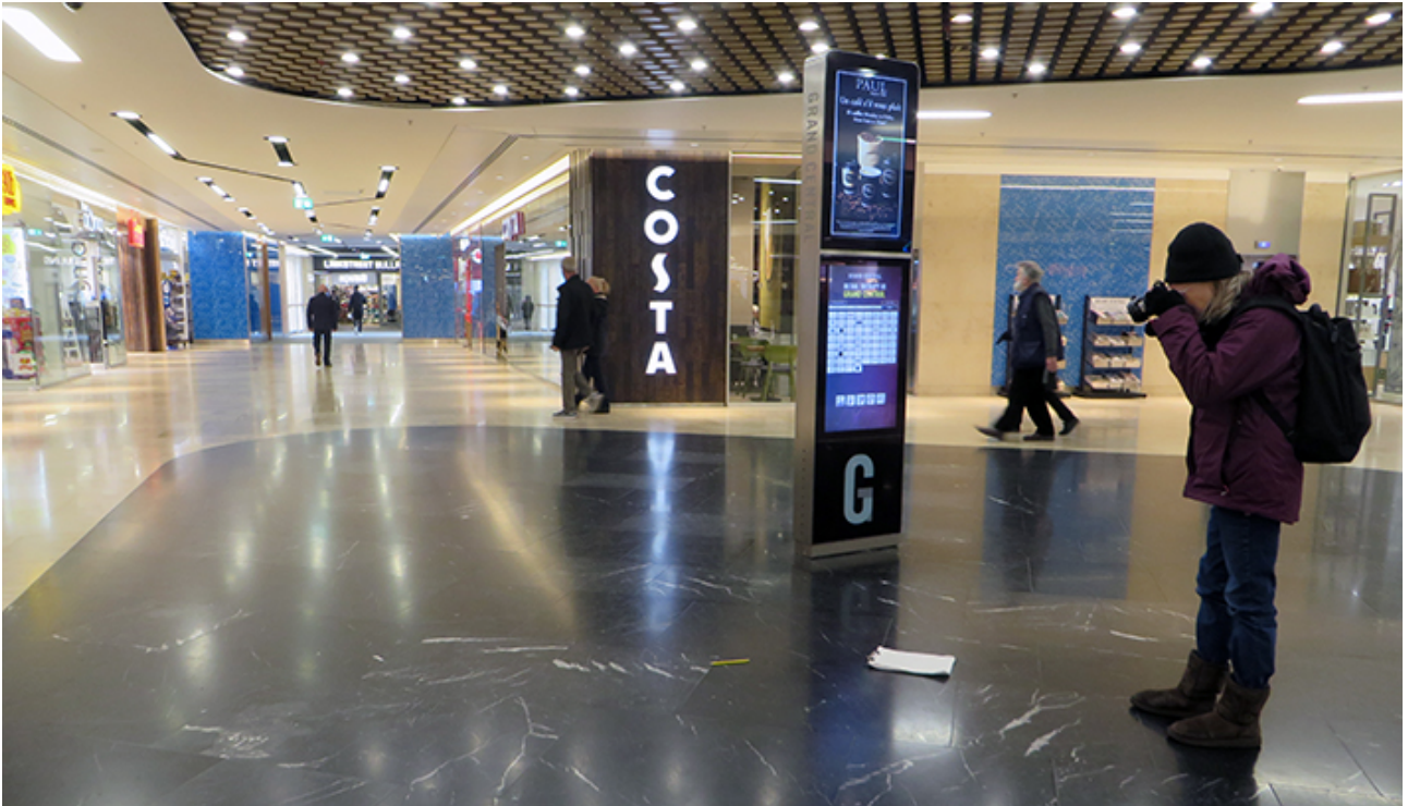
Julie attempting the near impossible task of photographing the highly reflective surface of Nero Marquina.

A black Spanish limestone, marketed as Nero Marquina is also used here. This is Mid-Cretaceous in age and comes from Marquina, in the Basque country of NE Spain. Like the Jura Marble, it takes a mirror-like polish, much enhanced by the blackness of the stone. It is a bituminous limestone with a micritic matrix, but fossils are preserved as white and include fragments of rudist and other bivalves and corals. Also the formation was weakly deformed and evidence of this are excellent, conjugate sets of en echelon tension gashes, infilled with white calcite, along with other veins. Good examples of these are seen in the 'island' of Nero Marquina close to the entrance to the linkway to the Bullring, outside Costa Coffee.