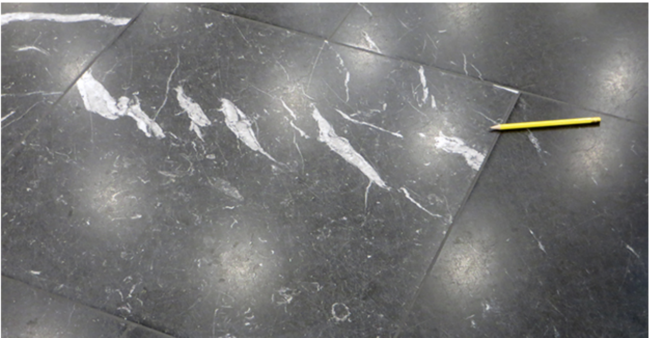
En echelon tension gashes and rudist fossils in Nero Marquina limestone.