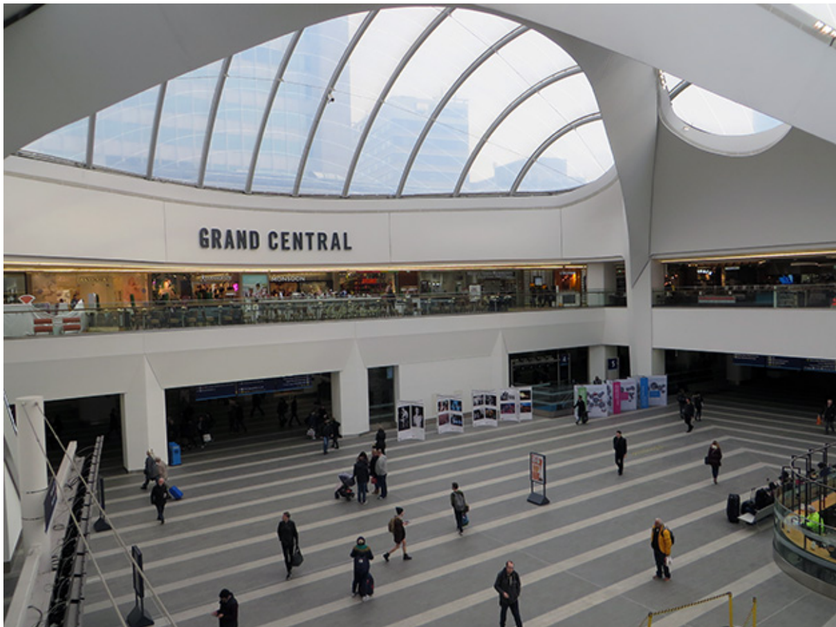
Grand Central and New Street Station concourse, with striped paving of Kobra and Royal White Granites.