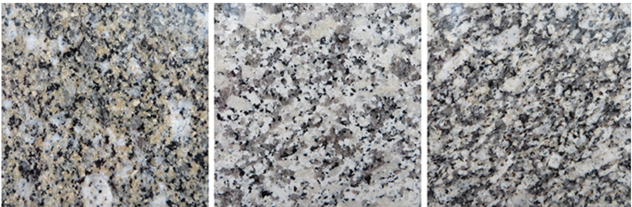
Above, left to right, brown granite, Sardinian Granite and Cornish granite. All images are at the same scale, field of view = 15 cm.

The darker-coloured, foliated granite is a variety of Cornish Granite . This texture is generally referred to as the 'small-megacrystic type' due to the brick-shaped feldspar phenocrysts, and granites with this texture were mainly acquired from the Carnmenellis and Bodmin Plutons. At 300 Ma, the Cornish Granites are the same age as the Sardinian Granite above, and related to the same mountain-building event, the Variscan Orogeny. Both suites of granites were intruded late into this orogenic phase. Unlike the Sardinian Granites which contain only biotite mica, the Cornish granites are two-mica granites and silvery muscovite is a distinctive component of the stone used here. Biotite is present in black flakes, showing a weak alignment. Plagioclase and grey quartz are also present in the groundmass.